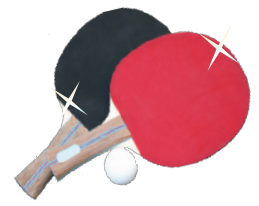
Table Tennis NON Sanctioned Tournament