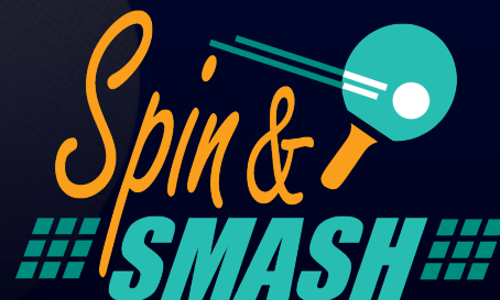
Table Tennis/Ping Pong Club