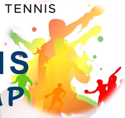
TABLE TENNIS SUMMER CAMP

Sign up at https://omnipong.com/T-tourney.asp?t=8&Region=7&e=2